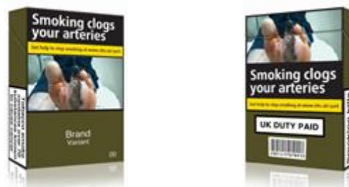
Figure 2: Research impact on standardised tobacco packaging

Events in the UK Parliament in 2013 helped raise awareness of research on standardised tobacco packaging, which came into force in 2016.