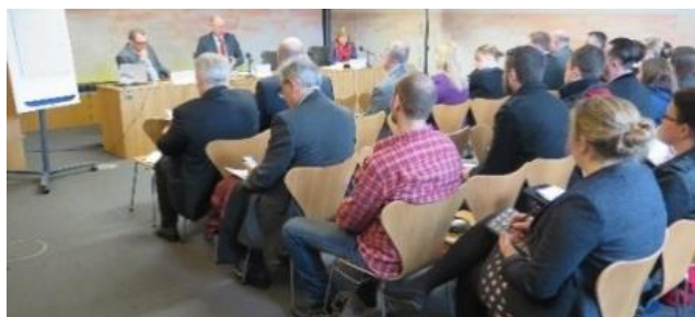
Figure 1: A Committee of the National Assembly for Wales

Health and Social Care Committee – Inquiry into new psychoactive substances – Report Launch, 2015.