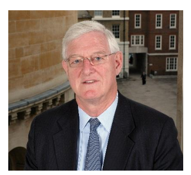
Gerard Elias QC Commissioner for Standards

Tel: 0300 200 6113 Email: Standards.Commissioner@assembly.wales