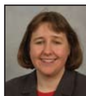
Lynne Neagle Torfaen