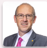
Llyr Gruffydd MS Plaid Cymru