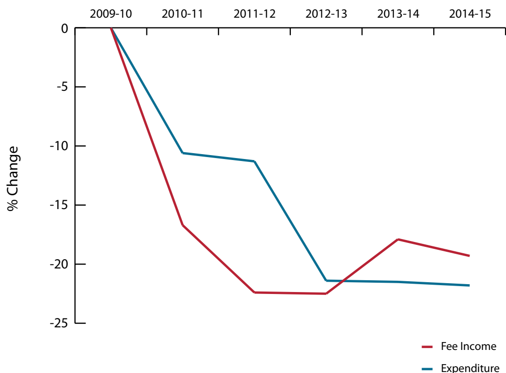
Exhibit 1 - Real terms reduction in expenditure and fee income 2009-10 to 2014-15