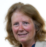
Julie Morgan Welsh Labour Cardiff North