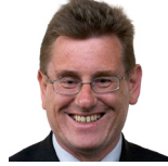
Peter Black Welsh Liberal Democrats South Wales West