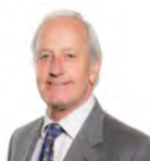
Neil Hamilton AM UKIP Wales Mid and West Wales