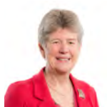
Jane Hutt AM Welsh Labour Vale of Glamorgan