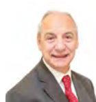
Mike Hedges AM Welsh Labour Swansea East