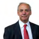
Mike Hedges Welsh Labour Swansea East