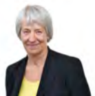
Jenny Rathbone Welsh Labour Cardiff Central